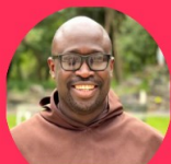
CARMELITE FRIARS Order of Discalced Carmelites, UK