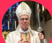
DIOCESE OF SOUTHWARK